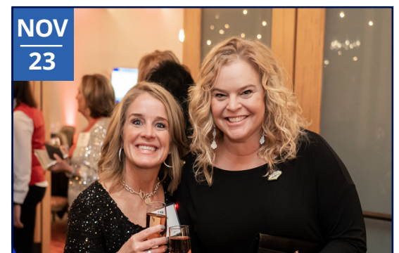
ARLINGTON OPEN Glencoe Golf Club